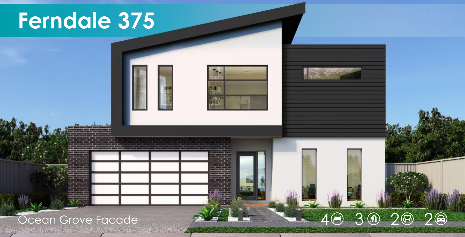
Ocean Grove Facade